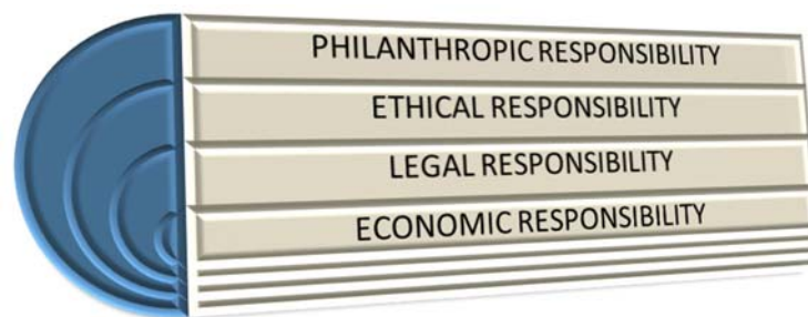
Fig 1: Pyramid of social responsibility by Carroll (1991) [2]

making profit the shareholders. Carroll developed a theoretical framework of CSR, where he proposed four dimensions of CSR. These are economic, legal, ethical and philanthropy of CSR. Carroll defined economic CSR is measured in terms of shareholders wealth maximization generates profit, being competitive (high quality & low cost), operational efficiency, and continuous profitability. Carroll defined legal responsibilities of CSR dimension is measured in terms of the extent that organization's activities are consistent with laws and regulations, law-abiding corporate citizen, fulfilling legal obligation, and goods and services must meet the minimal legal requirement. Carroll defined Ethical responsibility of CSR dimension is measured in terms of societal mores and ethical norms, extent that organization adjust themselves to emerging moral norms, degree of compromising ethical standards or norms, corporate citizenship behavior accepted by society and the extent that organization go beyond the legal and regulation requirements to maintain integrity of the organization. Carroll defined Philanthropic is the highest level of CSR, where it will be measured in terms of philanthropic and charitable expectation of society, assistance provided to fine and performing arts, extent that managers and employees of the organization involvement voluntary charitable activities organized by community, and assistance provided by organization to the projects that enhances "quality life".