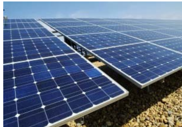
Plate 1: 185W Solar Panel

Thus, we over size the requirement from the modules by 1/(0.80 \times 0.85 \times 0.97) = 1.51