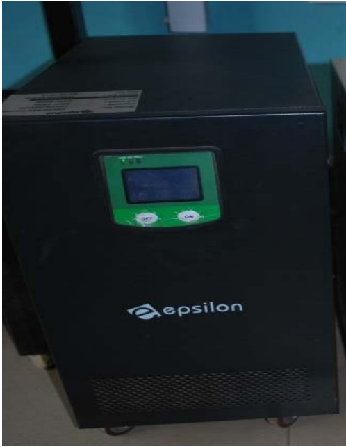
Plate 2: Power Inverter System

From the Load estimation worksheet, the total connected wattage = 7,190W Inverter Sizing = 30% (Total connected wattage) + Total Connected wattage = (0.30 * 8010+1900) + 9910 = 2973 + 9910 Inverter Sizing = 12,883W