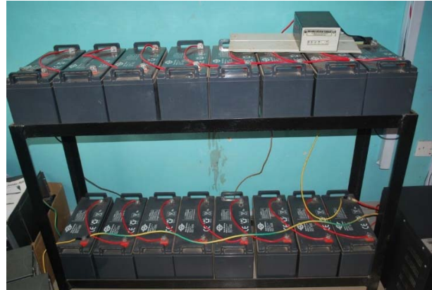
Plate 3: Set of Batteries inside rack

days of autonomy. Although the deep cycle batteries can be occasionally discharged up to 80 percent, but for longer life it is better to keep the routine discharge limit to only 50 percent. Given the unpredictable nature of PV systems, once in a while batteries pay visit to the 80 percent limit of DoD