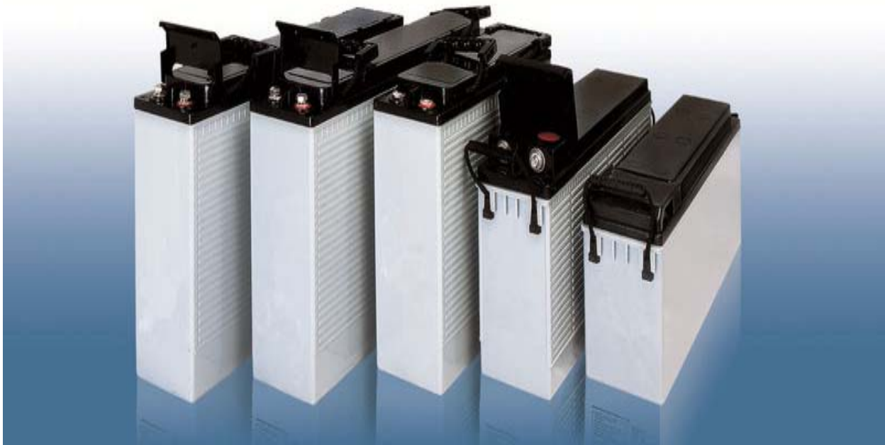
Fig 4: Dry Cell Batteries

This means the battery could supply 2400W for 1 hour, 1200W for 2 hours, the more energy you take, the faster the battery discharges. However we cannot be able to take all the power from a battery as once the voltage drops below equipment's requirements it will no longer be able to power it.