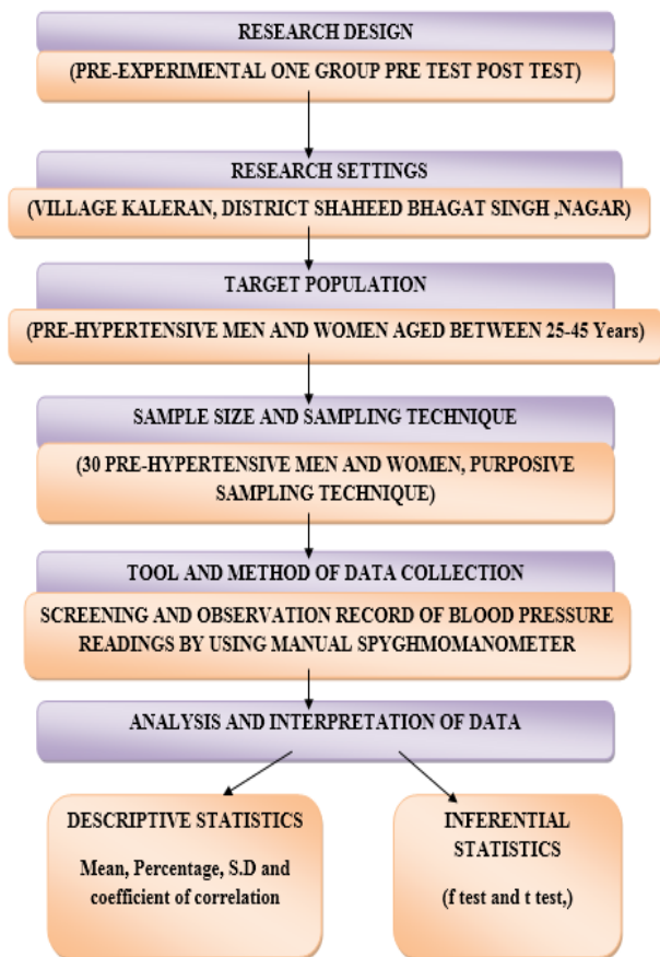
Fig 2: Schematic representation of study design.