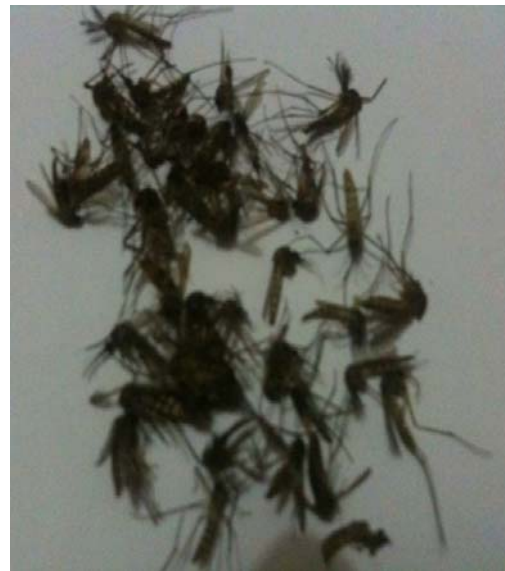
Fig 2: Showing killed mosquitoes.