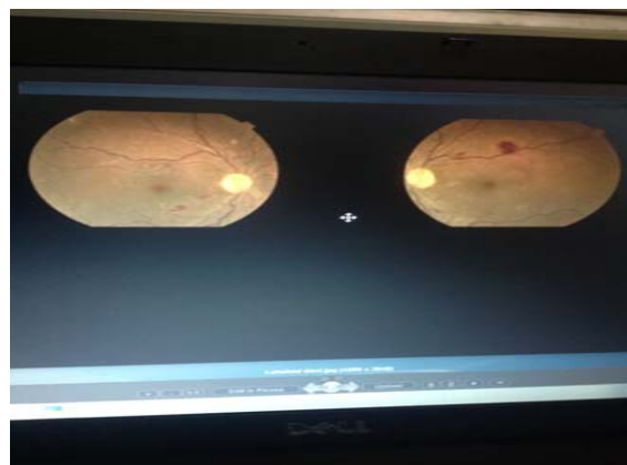
Fig 2: Showing Retinal Arterial thrombosis patient in Fundus examination