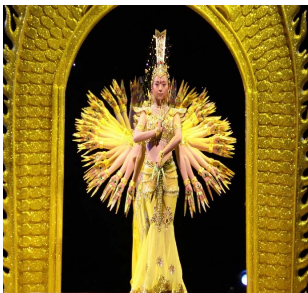
Fig 2: Video of Dance of Thousand-Armed Avalokiteshvara at www.youtube.com