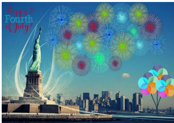
Fig 5: Students' Art Diagram of Holiday Greeting Card Created in 2013 Summer Pilot Calculus Course at Borough of Manhattan Community College-The City University of New York

Students also expressed their strong enthusiasm for this challenging project in their report as follows: