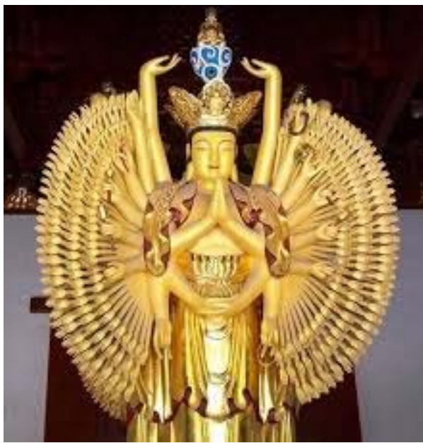
Fig 1: Thousand-Armed Avalokiteshvara (F1997.17.8, HAR324 at Rubin Museum of Art in NYC).