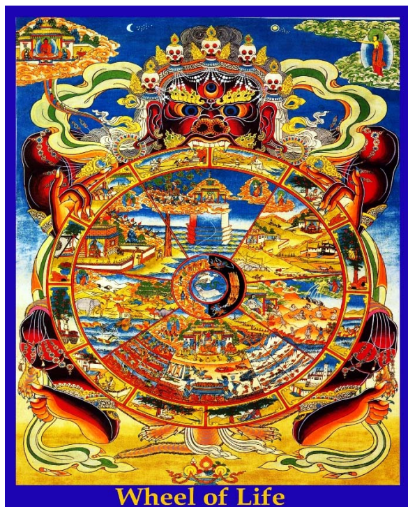
Fig 4: Wheel of Existence (C2004.21.1, HAR65356 at Rubin Museum of Art in NYC)