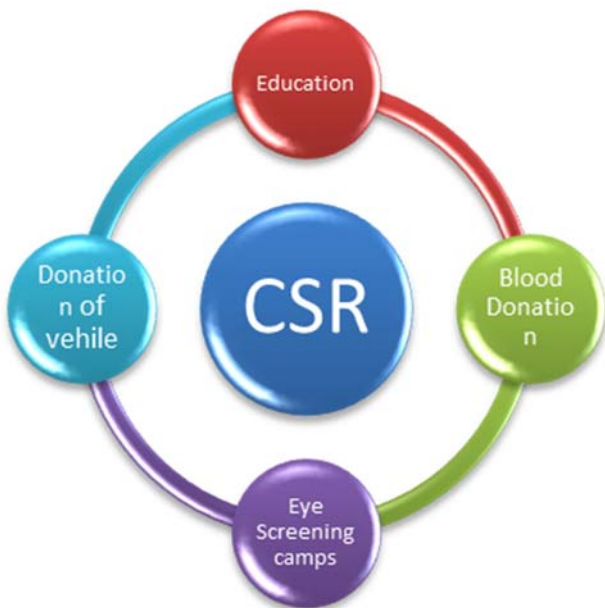
Source: Compiled by the researcher from the field survey, October 2015

HDFC Bank has undertaken several involvements and projects through the year to create a positive impact on the society while doing business. These projects take shape in many ways from corporate philanthropy to employee driven projects. These projects take shape in many ways from corporate philanthropy to employee driven projects. Few CSR activities undertaken by the bank are: