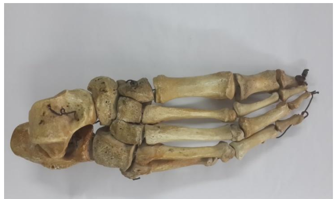
Fig 1: Showing a normal articulated Right foot.

Although coalition of metatarsal bones are uncommon relative to tarsal coalitions, this case report will throw light on the possibility of occurrence of such rare cases which may be beneficial to the Surgeons, Anatomists, Radiologists and Podiatrists. Also this case might be a differential diagnosis for the orthopedicians while treating a case of flat foot.