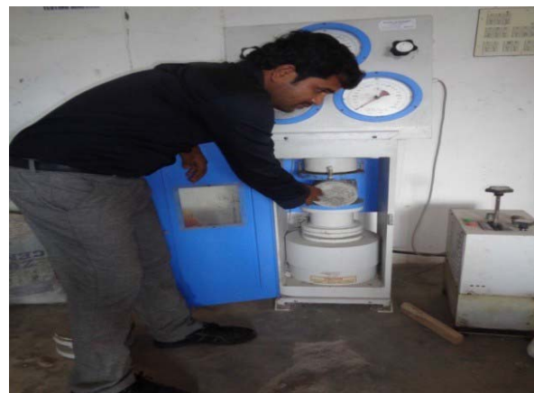
Fig 3: Tensile strength of concrete

L=length of the cylinder D=dia of cylinder