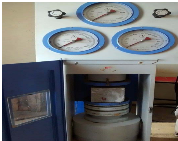
Fig 1: Compressive strength of concrete

The cube specimen of size 15cm X 15cm X 15cm was cast to test various concrete mixtures for compressive strength. The cubes after de moulding were stored in curing tanks and on removal of cubes from water at 7 days and 28 days the compressive strength was conducted. The water and grit on the cubes was removed before testing the cubes. The test was carried as per IS: 516- 1959.