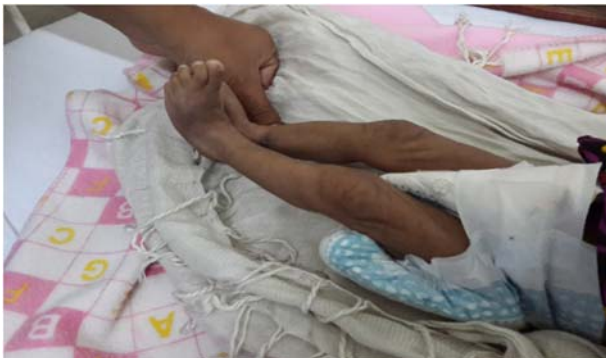
Fig 2: rocker bottom foot can be seen