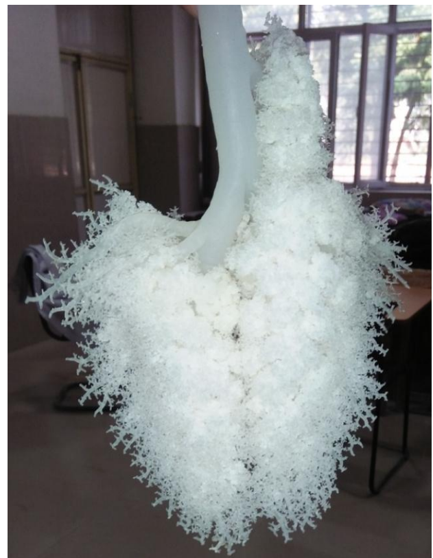
Fig 1: Shown tracheobronchial tree with alveoli, Luminal plastination done with Dow Corning R silicone sealant

Evaluation based on material used in luminal Plastination:- Dow Corning R GP silicone sealant are resilient flexible, maintain the mechanical property of Post curing i.e. Rubber like consistency and given splendid Luminal Cast Where as in GP silicone Sealant it lost their property after curing it become soften and fragile.