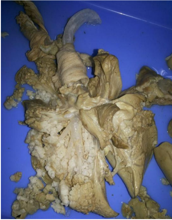
Fig 2: Luminal plastination with GP sealant in which post curing mechanical properties lost.