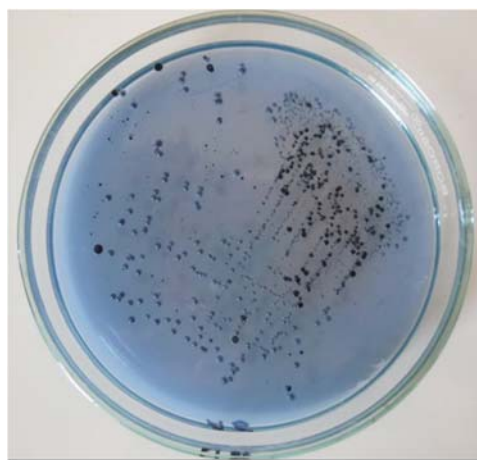
Fig 2: Streptococcus mutans colonies on Agar

Samples were inoculated on the Mitis Salivarius Bacitracin Agar. The plates were incubated at 37°C. Colony characteristics were studied after 72 h. Streptococcus mutans in saliva was determined by using a colony counter and the number of colony forming units was counted (figure 2).