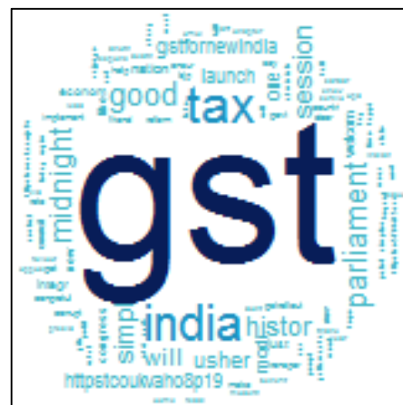
Fig 1: Word cloud "GST"

The Word Cloud has been generated corresponding to tweets mentioning "gst" as shown in Fig. 1.