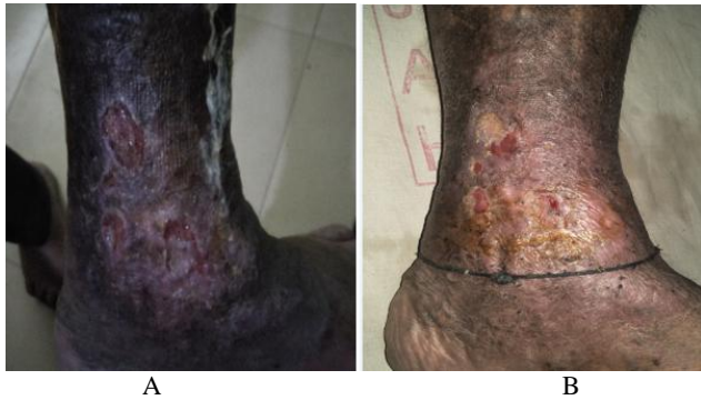
Fig 2: a showing venous ulcer over medial malleolus. Fig. 2b showing significant healing and reduction in size of ulcer on 2month follow up after the glue injection for varicose vein.