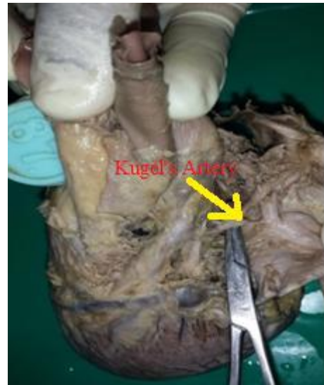
Shows Kugel's artery

The right coronary artery form an artey is called the Posterior interventricular artery. The dominance of the heart was decided according to the origin of posterior interventricular artery. Right dominance was observed in 18(70%) specimens. Left dominance was observed in 2(8%) specimens. Co - dominance was found in 5 (22%) specimens.