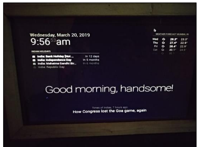
Fig 6: Real time based information