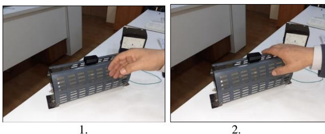
Fig 3: Therefore, it is advisable to touch the back of the hand before touching any electrical appliances, unless the power is exposed

When a person passes through the body, electric current reduces the muscles and burns the human body. Muscle contraction can exacerbate a person's breathing and stop the heartbeat. Therefore, it is advisable to touch the back of the hand (Figure 3) before touching any electrical appliances, unless the power is exposed (Figure 3).