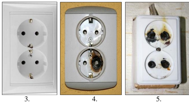
Fig 2: 3 A socket and a broken sockets

To avoid this, it is important to remember the following: The electrical current I on the circuit depends on the electrical conductivity of the circuit, the external resistance on the R circuit, and the internal resistance of the source r . If the internal resistance is too small ( R \gg r ) against the external resistance, the internal resistance will not have a significant effect on the current. In this case, the voltage at the source poles is approximately equal to the EWC. However, at short circuits ( P \rightarrow 0 ), the current on the circuit depends on the internal resistance of the source, and when the rpm is too small, the current I power increases, and Q = I^2 R t thermal dissipation may cause the wires to melt and the source itself to be inoperable (Figs. 1, 2 and 3, 4, 5). Therefore, we must be very careful about short circuit when assembling the electrical circuit and when working with the mains. Also, if you notice the heat of the socket and the plug, we can immediately disconnect the plug from the shield, call a specialist or troubleshoot the socket and plug based on what we have learned.