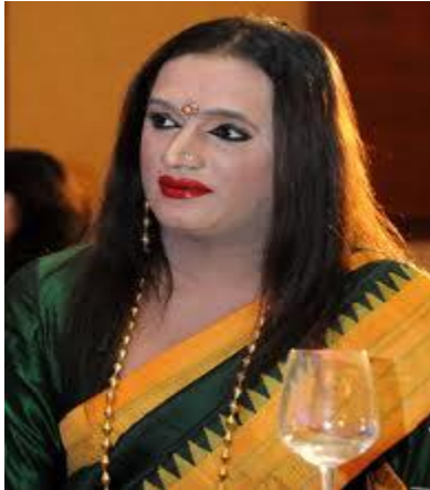
Laxmi Narayan Tripathi is a transgender rights activist, Hindi film actor and Bharatanatyam dancer in Mumbai, India

She says "Me Hijra, Me Laxmi", autobiography of transgender rights activist Laxmi Narayan Tripathi released in English. She was the first transgender person to represent Asia Pacific at the United Nations. Laxmi expresses inexplicable gratitude to her parents who accepted her with her anomalies. They never stopped me from expressing myself,"