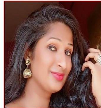
The first transgender RJ of Karnataka