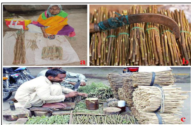
Fig 3. Tender stem of Karanj ( Milletia pinnata ) in market of Bhawanipatna, Kalahandi (a), Tender stem of babul ( Acacia nilotica ) as chew stick (b) and a shopkeeper making chew stick from the stem of plants (c).