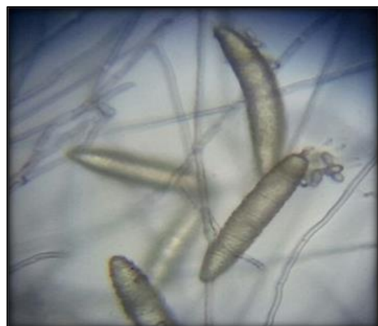
Fig 6: Microsporum gypseum