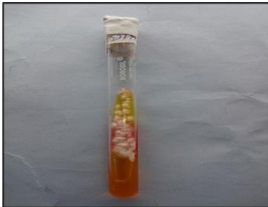
Fig 1: Growth of Dermatophyte on DTM

All samples were cultured on 2 sets of Sabouraud's dextrose agar with actidione & Dermatophyte test medium (Himedia). One set was incubated at 37 °C and other 25 °C in BOD (Biological Oxygen Demand) incubator. Tubes were observed for growth at least twice during the first week, and once a week thereafter, for a total of 4 weeks & were incubated for 4 weeks before discarding them as negative. Fungal growth was identified by colony morphology, pigment production, tease mount in LPCB, confirmatory biochemical reactions were also performed for identification of agent.