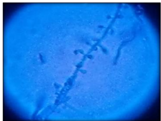
Fig 5: Trichophyton rubrum