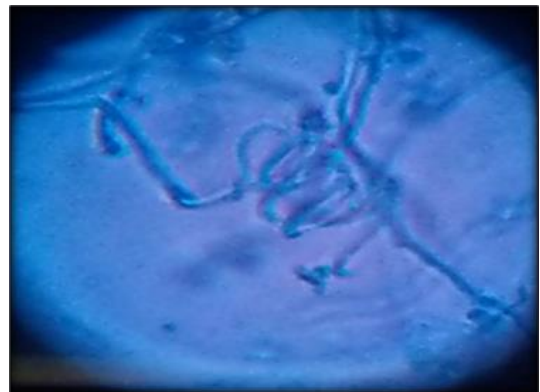
Fig 4: Trichophyton mentagrophytes