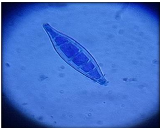
Fig 2: Microsporum canis