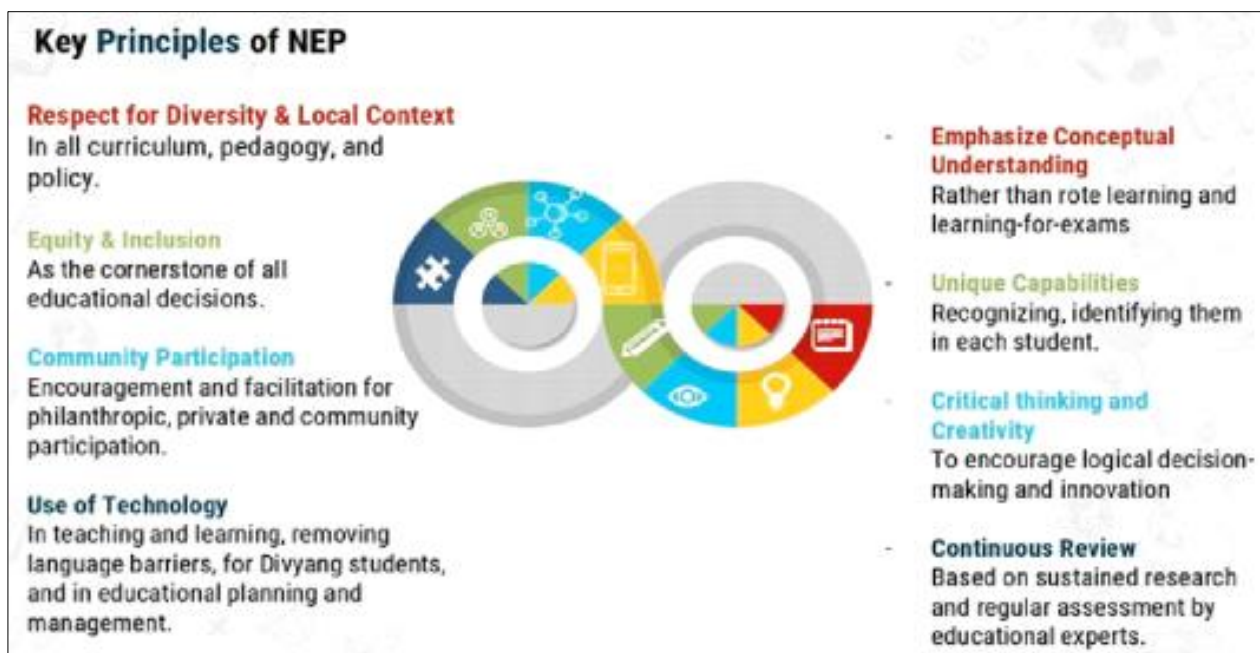
Illustration 1: Key Points of NEP 2020

The following are the main points of NEP 2020, which emphasizes community involvement and encouragement, equity and inclusion, respect for different perspectives and local context, and engagement.